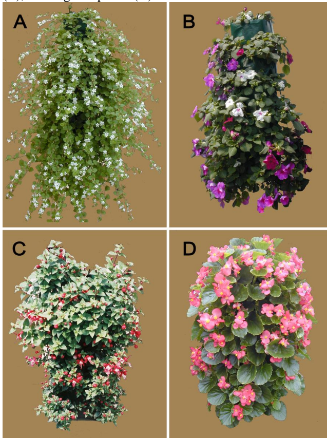
Figure 1. Normal, well proportioned bacopa in a hanging pouch (A), bottom-heavy impatiens (B), top-heavy fuschia (C), and begonia plants (D).

This study was conducted to evaluate the growth of calibrachoa in hanging flower pouches using different growing substrate compositions, polymer amendments, and the layering of substrate types with the goal of achieving more uniform plant growth and improved after-sale maintenance.